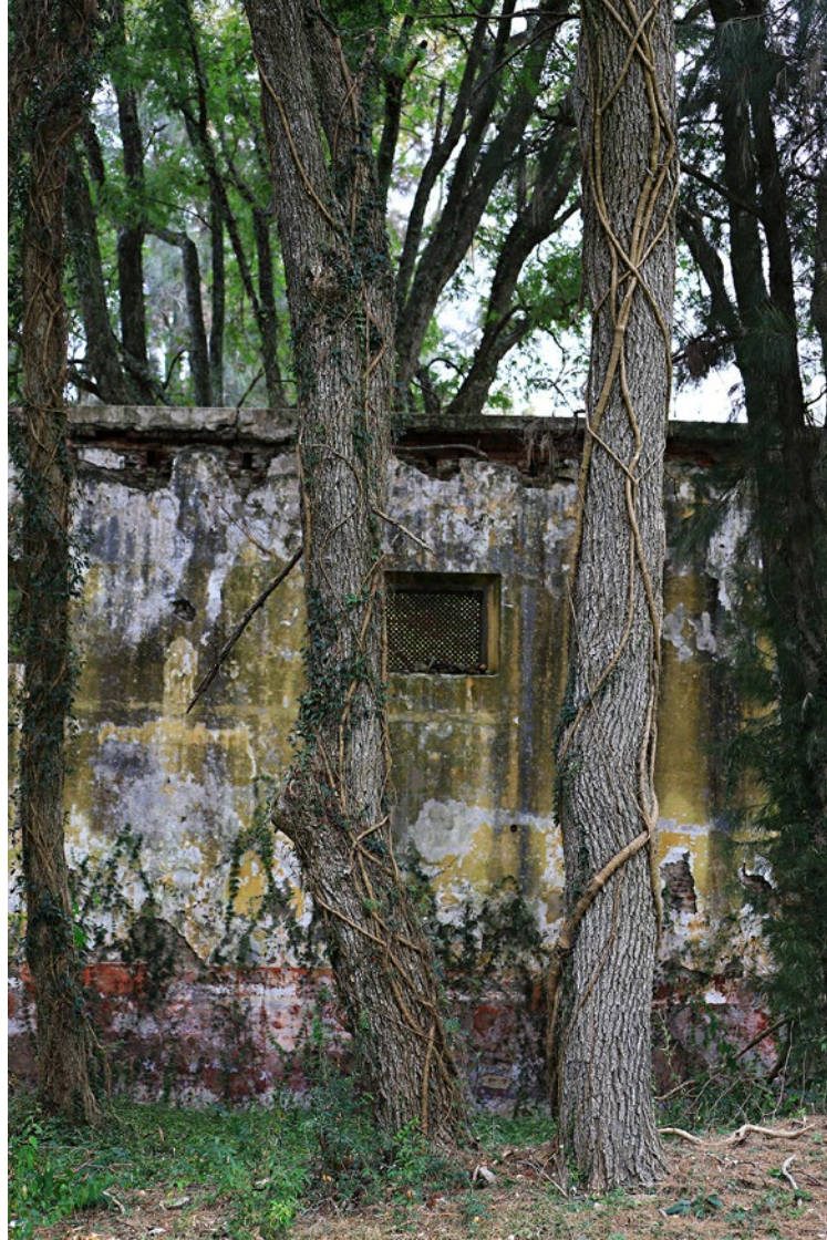
Secrets Series #12 Fine Art Print Glicée. Cotton fibre rag paper 100%. 60x40 cm. Edition of 5