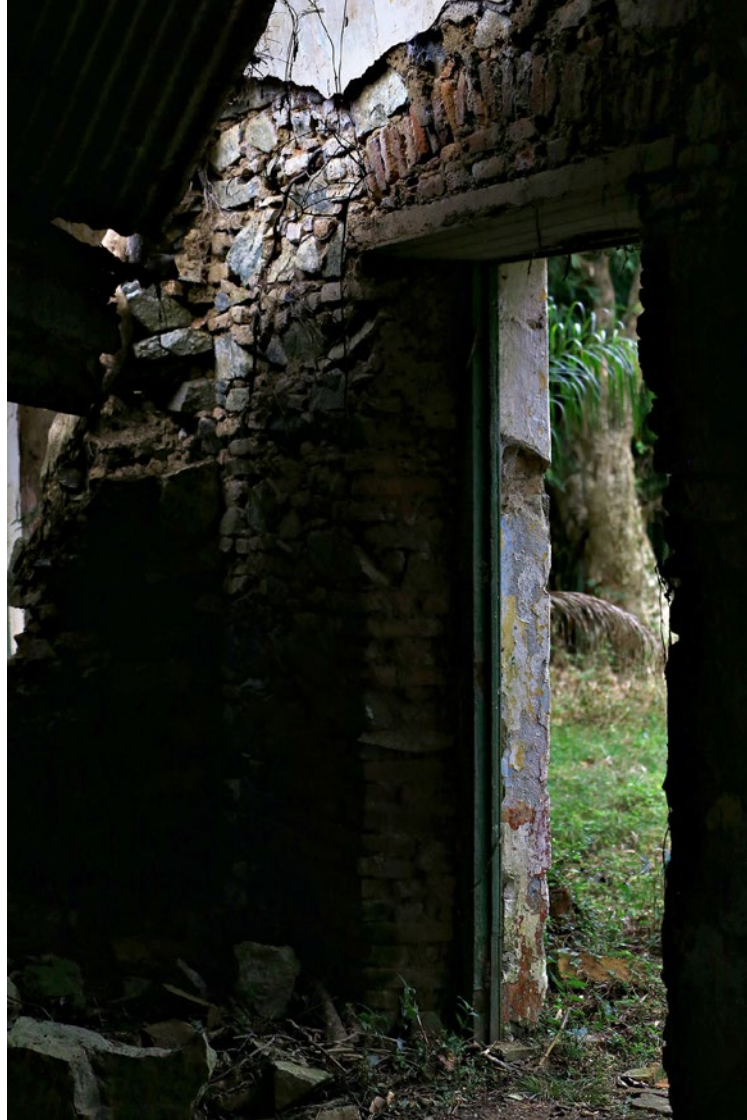
Secrets Series #10 Fine Art Print Glicée. Cotton fibre rag paper 100%. 60x40 cm. Edition of 5