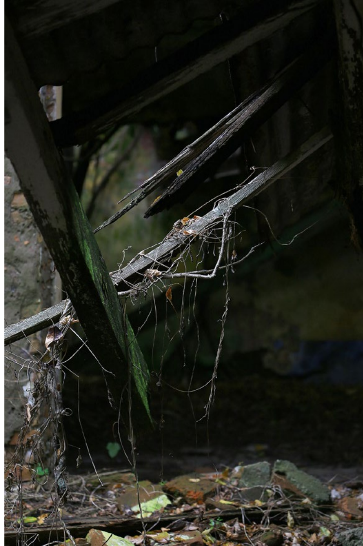
Secrets Series #11 Fine Art Print Glicée. Cotton fibre rag paper 100%. 60x40 cm. Edition of 5