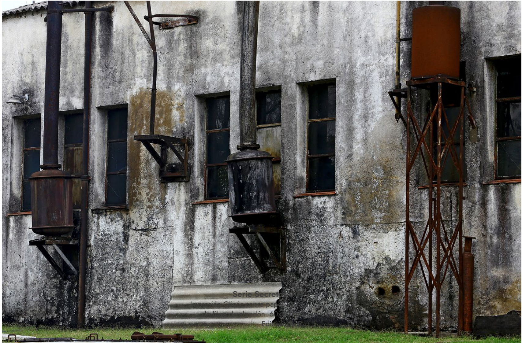
Secrets Series #05 Fine Art Print Glicée. Cotton fibre rag paper 100%. 60x40 cm. Edition of 5