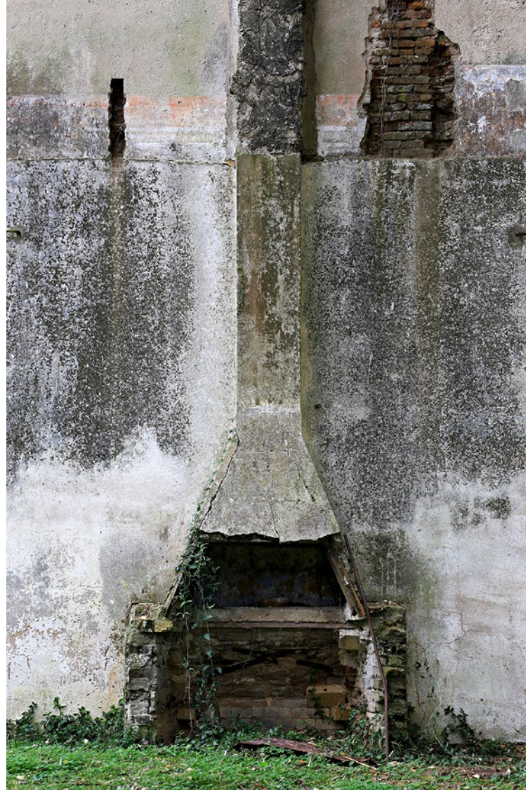
Secrets Series #07 Fine Art Print Glicée. Cotton fibre rag paper 100%. 60x40 cm. Edition of 5